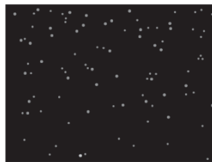
Just the Right Amount