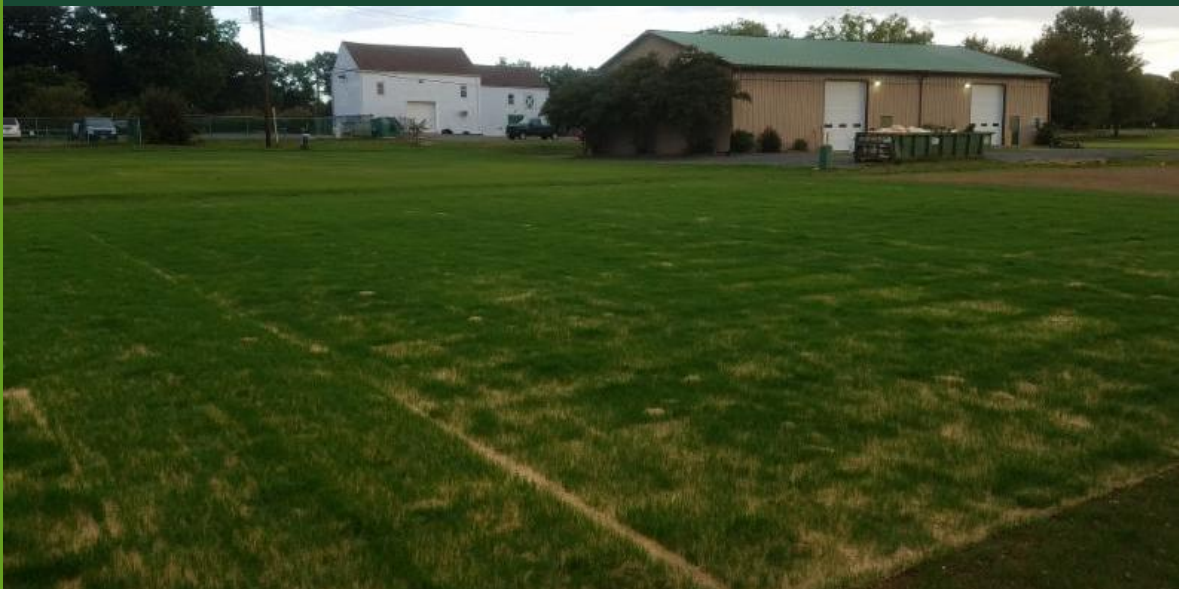
Photo: 2018 National Turfgrass Evaluation Program (NTEP) plots at Rutgers Hort. Farm.